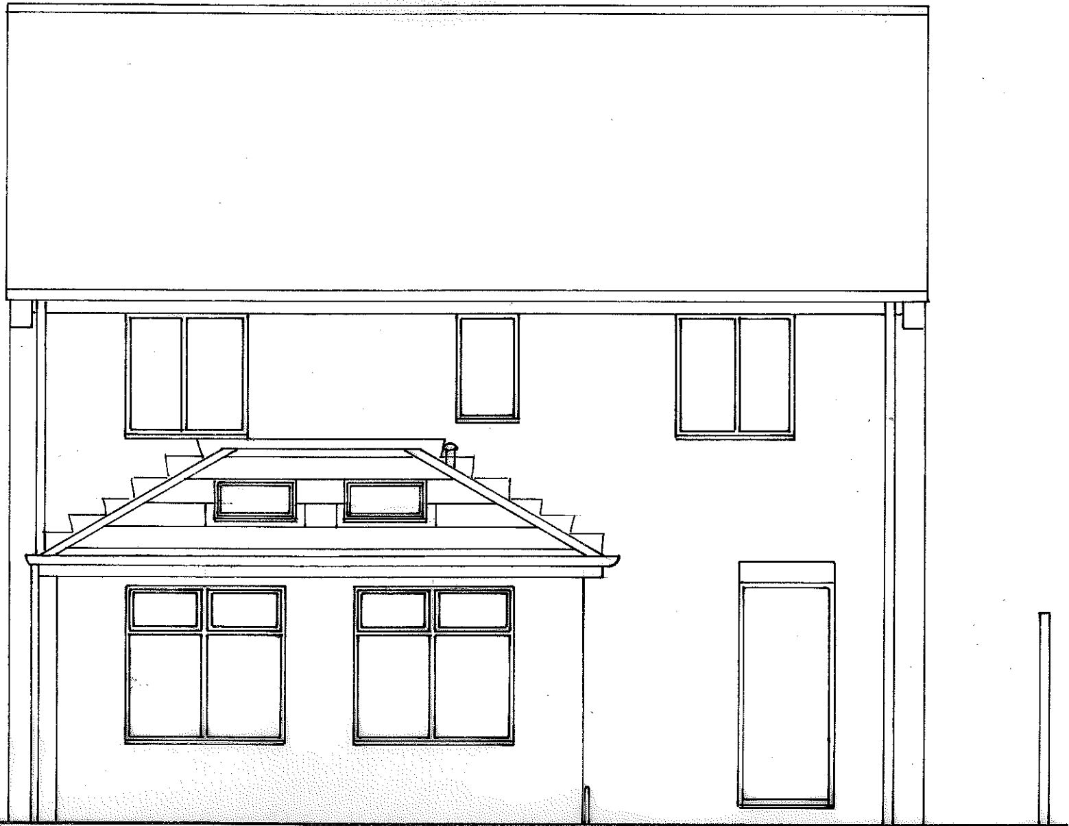
PROPOSED REAR 1:50